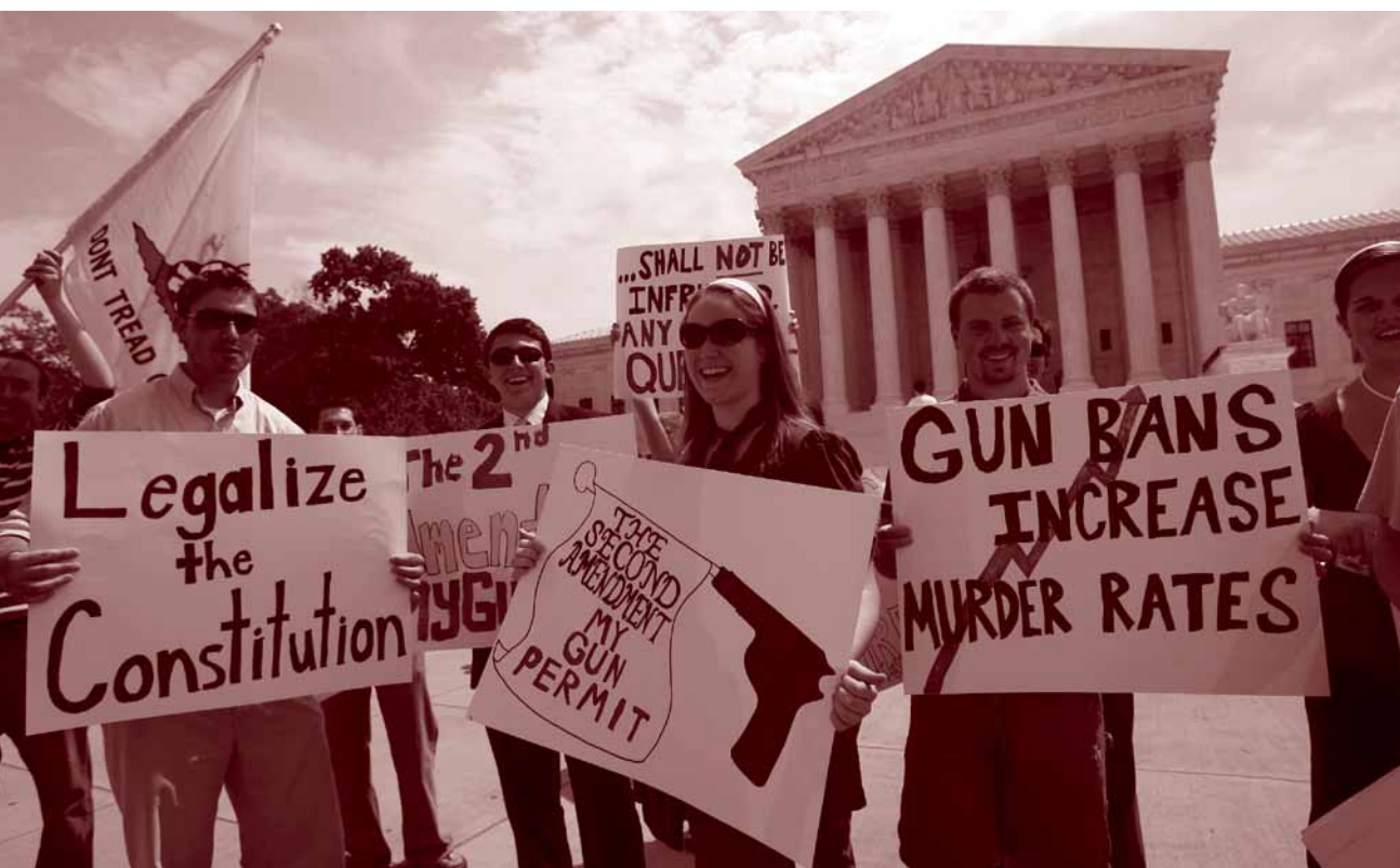
Gun rights supporters hold up banners outside the Supreme Court in Washington, DC, after the court ruled that US citizens have a constitutional right to keep guns in their homes for self-defense, June 2008.

At the US state level, the majority of jurisdictions have adopted the so-called ‘Castle doctrine’, also known as ‘Stand your ground’ laws. This doctrine (the title of which is derived from the adage: ‘an Englishman’s home is his castle’) permits a person to use deadly force to defend him- or herself and anyone inside his or her home from an attack by an intruder if he or she reasonably believes that force is immediately necessary, and provides that a person in lawful residence does not have a duty to retreat before using deadly force.