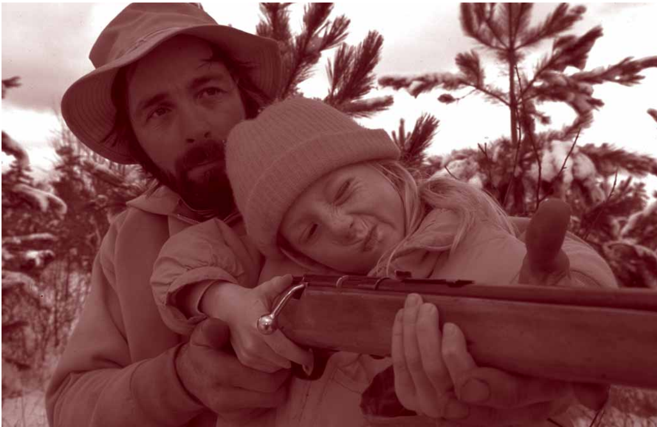
An eight-year-old hunter-in-training aims her rifle with the help of her father in Minnesota, November 1998.

Most countries prohibit the acquisition and ownership of guns by young people and minors, or at least restrict the types of firearm-related activities young people can engage in or the types of firearms they can possess. As illustrated in Annexe 9.1, most of the sample countries do not permit ownership of a firearm until a person has reached 18 years