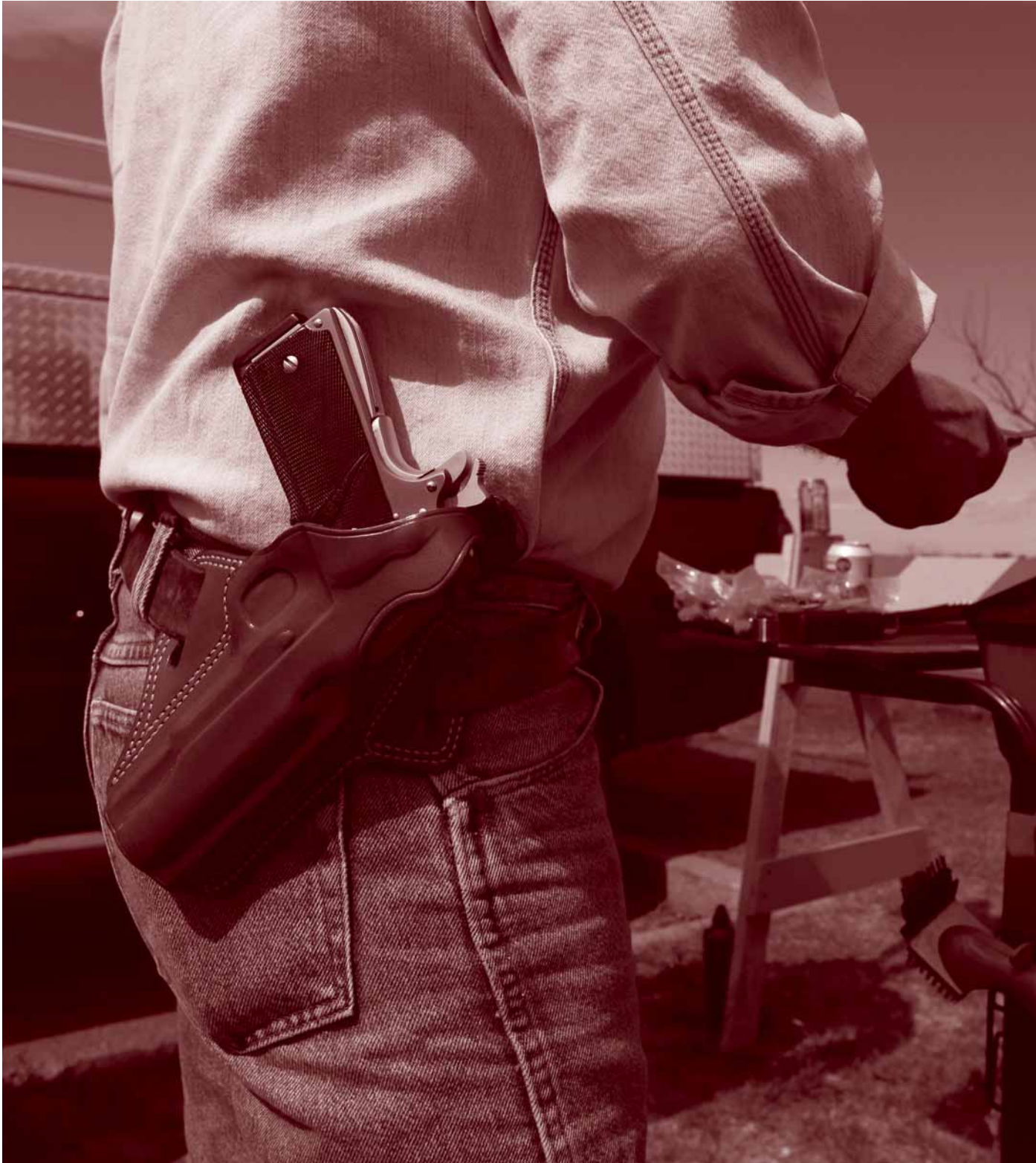
A gun owner wears a .45 calibre semi-automatic pistol as he barbecues at a gun-rights rally in Portland, Maine, April 2010.