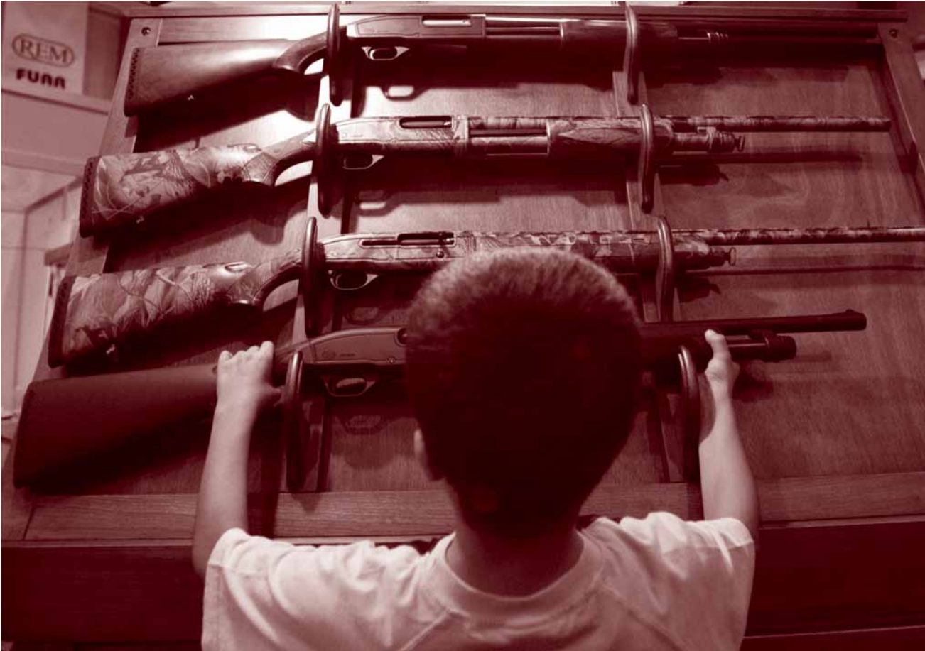
A Turkish boy looks at hunting guns during the Third Gun, Hunting & Nature Fair in Istanbul, September 2004.

Most countries do, however, allow private sales between civilians. Generally, where states permit civilians to buy and sell firearms privately, they stipulate that the purchaser must hold the relevant licence or acquisition permit (as is the case in Canada , Estonia , Finland , Kenya , Papua New Guinea , Uganda , and the United Kingdom ) and the seller must notify the licensing authority, police department, or registrar, as the case may be, of the transfer. The latter is the case in Belize , where notification must occur within 14 days (Belize, 2003, s. 14(1)), Canada (Canada, 1995, s. 85(2)), Finland , where it must occur within 30 days (Finland, 1998, s. 89), Kenya , where it must occur within 48 hours (Kenya, n.d.a, form 2, s. 4(3)), Uganda , where it must occur within 48 hours (Uganda, 1970, s. 21(2)), and the United Kingdom , where it must occur within 7 days (UK, 1997, s. 33(2)).