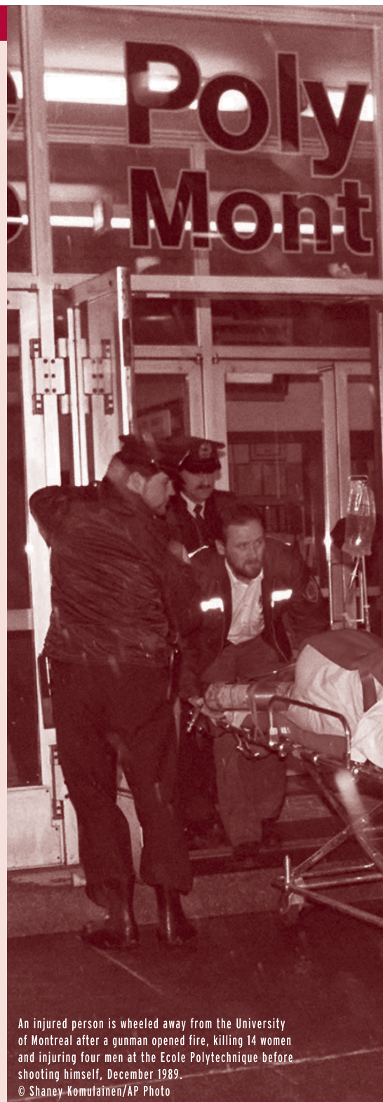
An injured person is wheeled away from the University of Montreal after a gunman opened fire, killing 14 women and injuring four men at the Ecole Polytechnique before shooting himself, December 1989.

New Zealand. The Aramoana massacre of 1990, in which 13 people were killed with a semi-automatic rifle, prompted a review of and amendments to the Arms Act of 1983. Some of the changes included: (a) the introduction of a new class of gun—military-style semi-automatic (MSSA) firearms—and additional restrictions imposed on them; (b) licences ceased to be