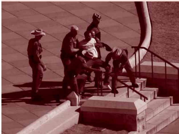
Authorities remove a man from the Texas Capitol after he fired off a few rounds into the air in January 2010. A few months later, legislators ordered magnetometers installed at all four public entrances to the capitol.